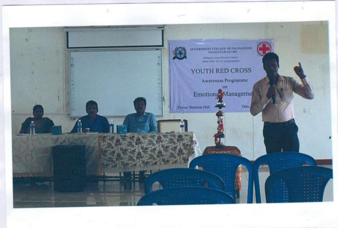
Portion of Audience